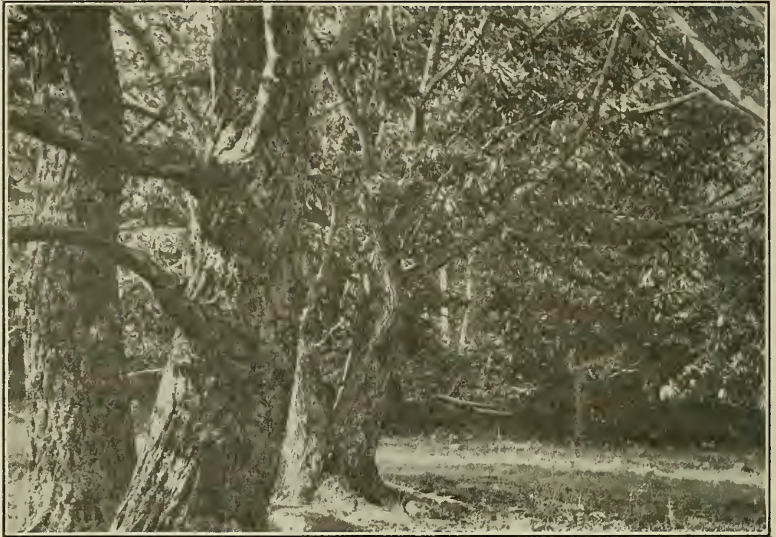
FIG. 3. Chestnut Grove, Apple Orchard Mountain, Virginia.

on a mountain summit, but these could be renewed from time to time and the garden could be started under trees to shield it from our August sun.